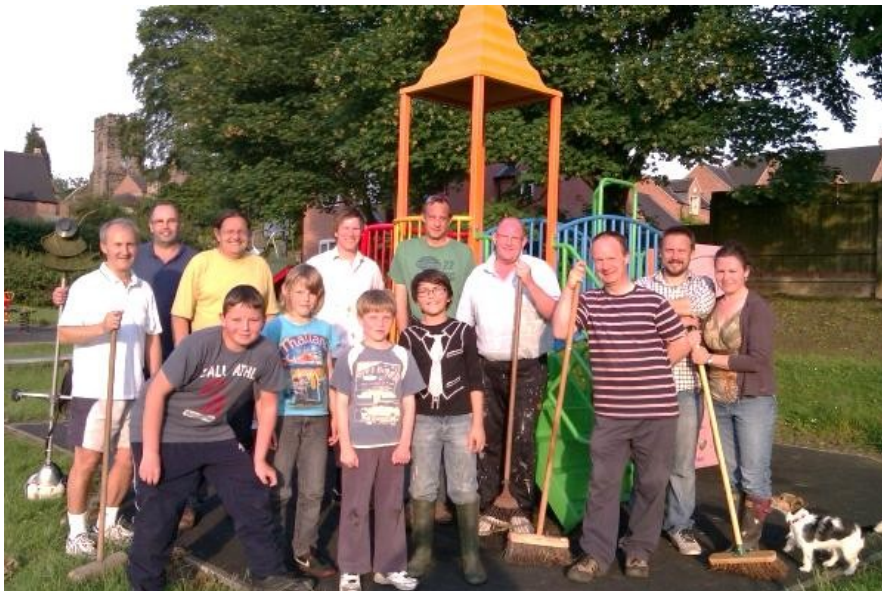
Clean up team at Main Street recreation ground

The fundraising for a new pavilion continues and we hope to have a suitable building in place for the start of the 2014 season.