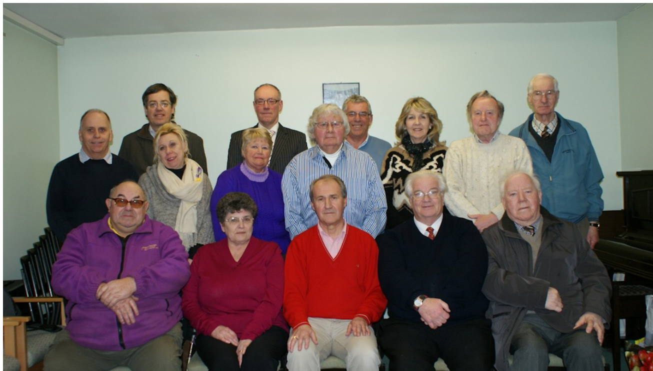
HARTSHORNE PARISH COUNCIL 2013

Hartshorne Parish Council is one of the larger Parish Councils in South Derbyshire having 15 members. Parish councillors are elected every four years or are co-opted onto the Council if insufficient candidates come forward for election. Parish Councillors are unpaid. Hartshorne PC employs a Parish Clerk and a lengthsman who collects litter throughout the Parish on a weekly basis and inspects the recreation grounds. The Council is financed by grants from the District Council and by parishioners through the Parish precept added to council tax bills. The Parish Council maintains three recreation grounds, carries out minor maintenance, makes small grants to support local organisations, comments on local planning applications and makes appropriate representations on matters affecting the Parish.