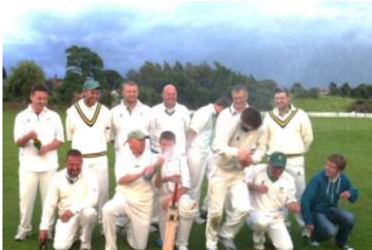
HCC 2 nd XI celebrating promotion

www.pitchero.com/clubs/hartshornecricketclub