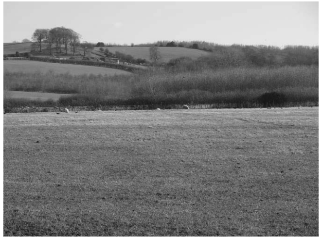
The Rodney Meadow

A planning application has been submitted to South Derbyshire District Council to build 68 houses on the field opposite the Admiral Rodney. There is much local concern about this proposed development and 169 letters objecting have been sent to SDDC. The proposal includes space alongside Main Street for a car park to enable parents to park off road when bringing children to the primary school. This will require a revision of the road layout to provide a pedestrian crossing. Also proposed adjacent to Main Street is a green space and a play area. At the time of going to press no decision on the application had been made by SDDC. A public meeting of concerned residents held on the 9 th of March opted to form a Village Residents Association aimed at protecting the village and its environs. If you wish to be involved in the Association or require more details then contact Jim Gosden (tel. 217656) or Ray Fairbrother (tel. 214548).