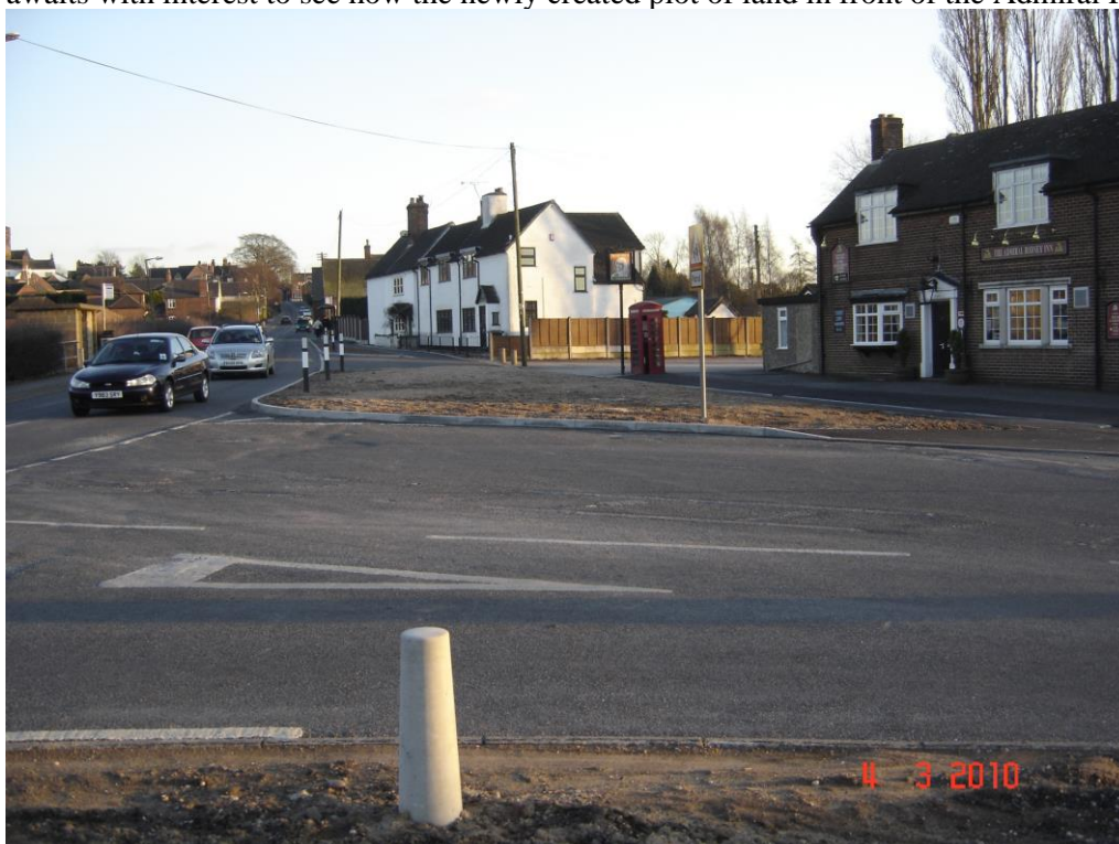
The new Rodney Junction - Vital improvement or waste of money??

In the few weeks the new arrangement has been in place in Hartshorne there have already been two accidents at the junction! The Parish Council has been informed that the full cost of the works will be approximately £40000 and awaits with interest to see how the newly created plot of land in front of the Admiral Rodney will be landscaped.